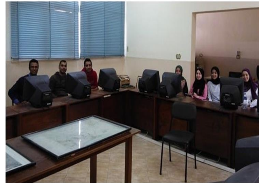
Students of Alexandria and Damanhur University