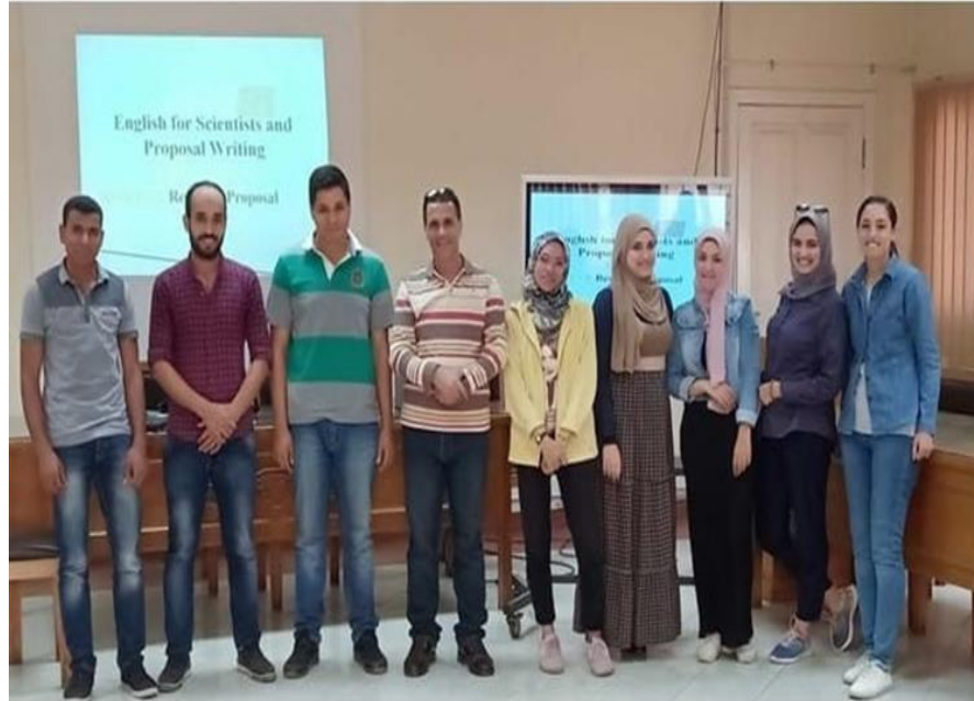
Students of Cairo and Zagazig University